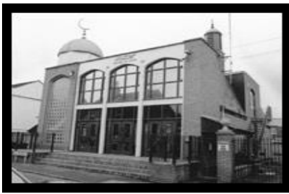
MASJID E NOOR (1983)